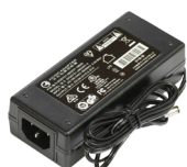
28V 2.57A adapter (PoE version)