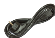
IEC cord (PoE version)