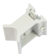
Pole mount bracket