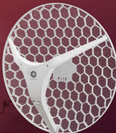
LHG 5 ax XL

A compact, long-range CPE with a 24.5 dBi antenna. Perfect for links up to 20 km in most scenarios.