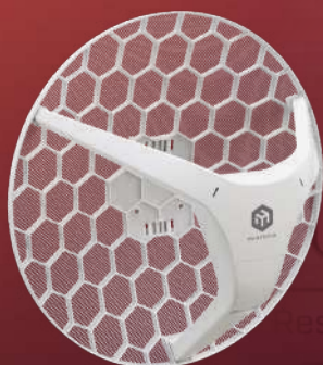
LHG 5 ax

Two Models. One Mission: reliable Wi-Fi 6 long-distance links.