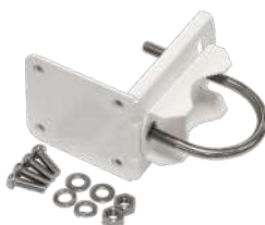
LHG precision mount